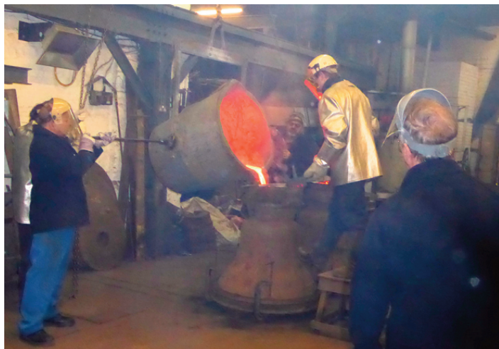
The new bells being cast at Whitechapel