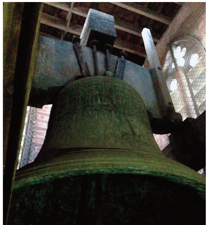
The Murphy bell at the Sacred Heart, Exeter

STOP PRESS: We have just heard that this bell is to be rehung with an electric chiming hammer.