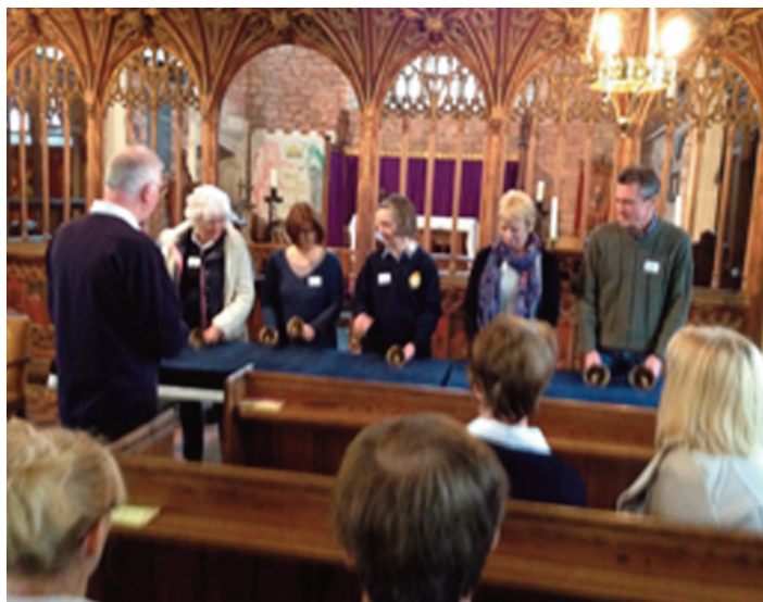
Handbells at Berry Pomeroy