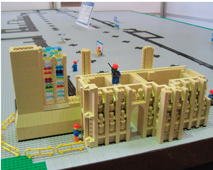
A long way to go yet. I like the armed guard on the roof!

As part of a fundraising scheme Exeter Cathedral has commissioned a scale model of the Cathedral made out of LEGO bricks. The final model, made up of 300,000 LEGO bricks, will be an impressive 3.6m long, 2m wide and 1m high. The base of it is portable and is mostly in the west end of the Cathedral. Building has started – so far a small part of the west front has been completed – it is still crawling with LEGO builders! If you want to see it do call in – despite the warnings about admission charges you can visit the model without going past the till. And if you wish to buy a brick or two (at £1 a time) you can place them on the model yourself (with guidance).