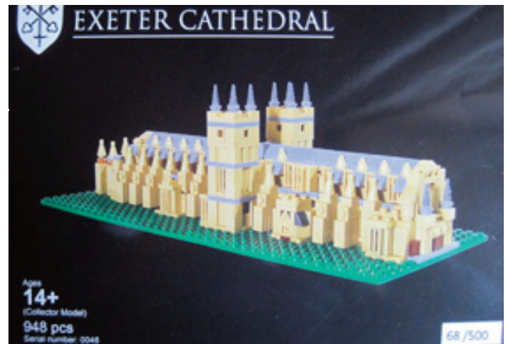
The limited edition smaller model that I have bought for – erm – me

If you know anyone who likes LEGO (over 14 but no upper age limit!) there is a (much smaller) limited edition 'Collector Model' of the Cathedral which can be bought in the shop (£40 unless you can get a staff discount – try to find a friendly member of the Cathedral band). Tell them at the till that you are visiting the shop to avoid admission charges. Incidentally the shop is also selling 'pick and mix' LEGO figures – for a few pounds you can choose a head with the required expression, hair, body, legs, implement to hold, etc which might appeal to younger people – or grandparents!