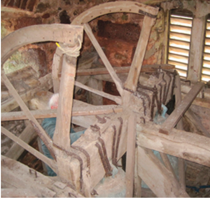
The second and tenor at Ashcombe – with three-quarter wheels

Ashcombe , above Dawlish, was visited in January. It is one of the most complete pre-reformation rings of bells in the diocese with very little apparently done to them since their installation. The bell frame would appear to date from the 16 th century or even earlier. The three bells are hung with what is described as three-quarter wheels although I would call them more like five-eighths! We performed some basic maintenance on the bells and frame and got two of them swinging gently – the tenor could not be rung as the wooden top on the clapper had completely disintegrated and the clapper was on the floor!