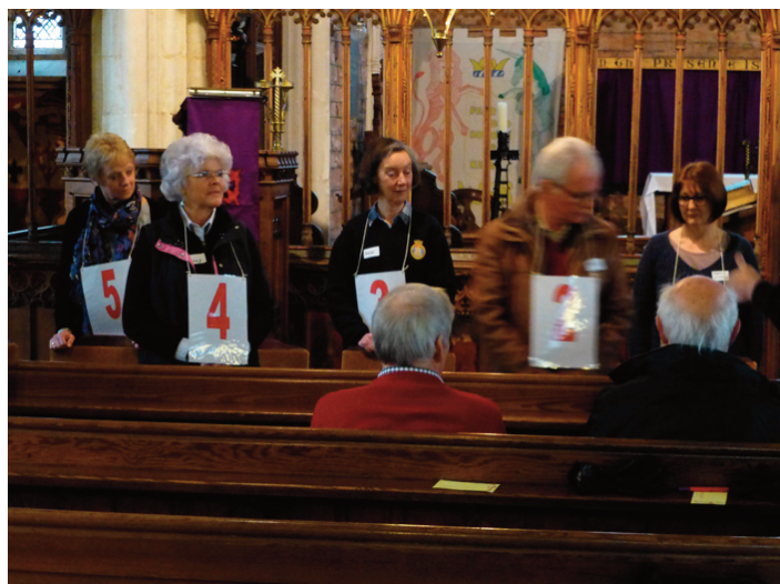
Walking Plain Hunt at Berry Pomeroy

For some time, our branch has been concerned that attendance has been dropping at branch events. It was decided to try a 'Meet the Branch Day' as a way of meeting ringers and as a 'shop window' of branch activities.