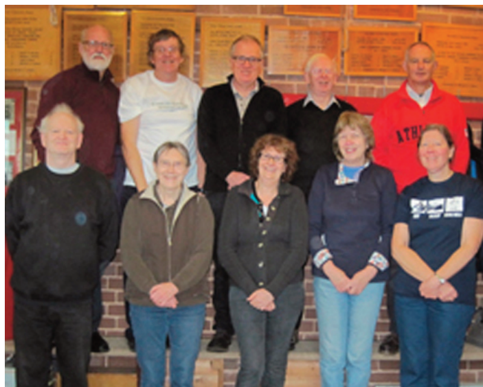
The band in order, starting bottom right