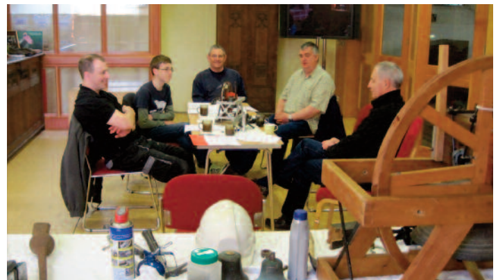
Having a break at Stoke Cannon