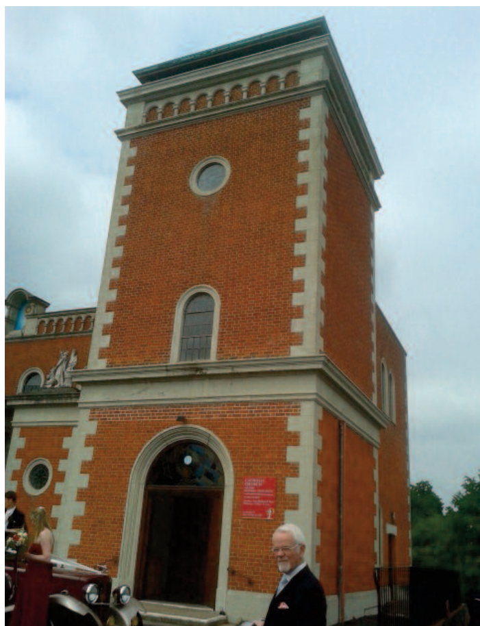
The tower at The Blessed Sacrament housing the bourdon bell