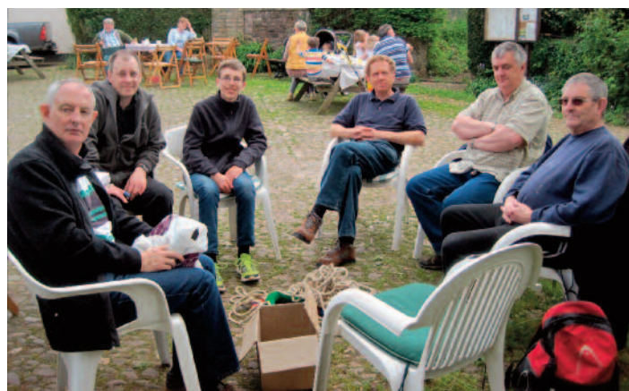
Enjoying the sun while splicing ropes