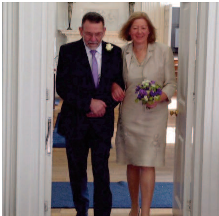
Didn't he scrub up well!