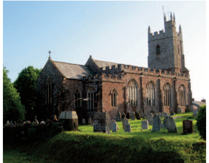
Silvertown Church from the Judges' Hideout

The annual John Hutchings Memorial Competition was held at Silvertown on Friday 3rd June. It is open to all towers in the North East Branch and attracted five entries including a Ringing Master's scratch team (eligible for marking but not for the competition Cup).