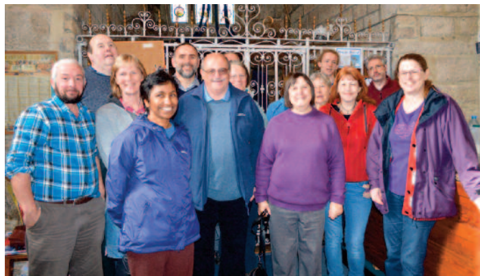
The assembled ringers

The weather was kind for our March 12th 6-bell practice at St Andrew's, Whitchurch, with one of those very first clear bright days of the year. One that helps to convince the sceptic in us that Spring is at last on its way. Sun streamed through the stained glass nearby onto us ringers striving to improve our skills at Bob Doubles and the occasional other Doubles method also. We hadn't anticipated company, but hope our efforts were good enough to be a pleasant accompaniment to the team cleaning the church alongside us. Were our efforts as polished as theirs?