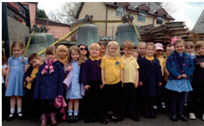
Some of the pupils from Hatherleigh school with the bells from Meeth in the school playground