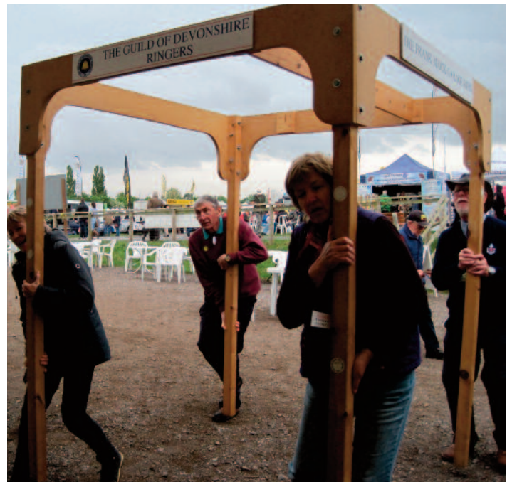
Moving the mini-ring frame out of the rain

The weather was not over warm and the attendances at the mini-ring seemed rather lower than in some previous years. However the ringing before the 9am service every morning was appreciated by the clergy and congregation, and a number of contacts with previous or prospective ringers were made.