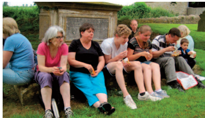
Lunch in the churchyard at Middle Chinnock