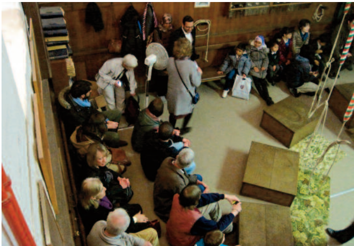
Visitors sitting two-deep ready to watch the ringing

Exeter Cathedral opened its doors for the evening of Tuesday 19 th April to showcase everything done by the volunteers as part of the spiritual and working life of the Cathedral community. Entry was free and all visitors were able to meet the groups of people who do so much “behind the scenes” work and also visit some of the restricted areas not normally available to the public. Over 500 people attended the event.