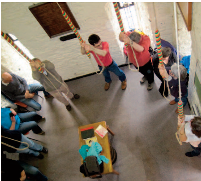
Ringing on the light 10 at Whitehall

The lunchtime pubs were all too busy to take us as they were dealing with the street party (for the Queen's 90 th birthday) so we had a picnic in the churchyard before going to the four bells at West Chinnock. Several members of the team had a drink in the pub and a look around the street party before overcoming a nearly vertical metal ladder and a leap across the opening at the top to get into the ringing chamber. We rang a number of Minimus methods before cycling on to the unusual five at Chiselborough where the bells are hung in front of the altar.