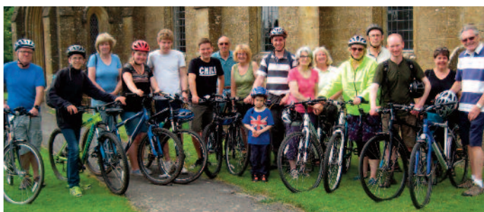
Most of the group – apart from the photographer!

Over a dozen intrepid cyclists and several hangers-on joined the St Mark's ringing outing held in Somerset on 11 th June. We met at the rather heavy going six at Hinton St George, then cycled through some pretty villages to ring on the light three bells at Middle Chinnock which were clearly well maintained and a delight to ring. Stedman Singles is more challenging than you might think!