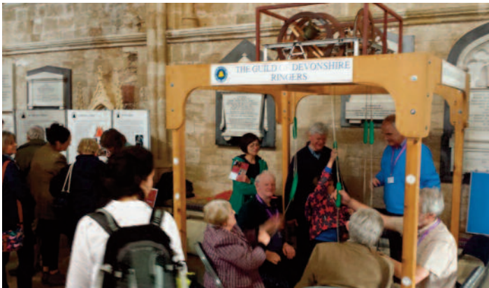
The mini-ring in use in the cathedral

Exeter Cathedral opened its doors for the evening of Tuesday 19 th April to showcase everything done by the volunteers as part of the spiritual and working life of the Cathedral community. Entry was free and all visitors were able to meet the groups of people who do so much “behind the scenes” work and also visit some of the restricted areas not normally available to the public. Over 500 people attended the event.