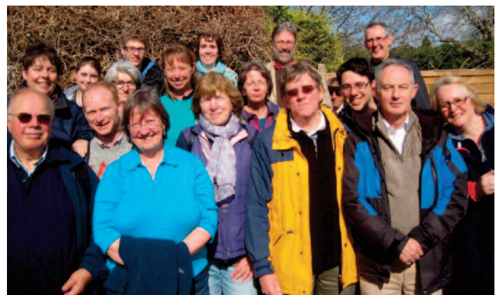
Waiting for the train at Redland

The Exeter Branch train outing on bank holiday Monday 2nd May was organised to try out the branch line from Bristol to Severn Beach. We took the train to Temple Meads and rang at SS Philip and Jacob, Bristol. Then we went back to Temple Meads to catch the train to Lawrence Hill and rang on the light 10 at St Ambrose, Whitehall, followed by lunch in the Wetherspoon's where a few people had fun sampling the gin and other drinks that they offered.