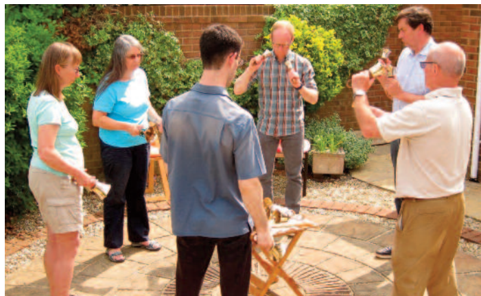
The traditional attempt at a twelve bell touch

through the afternoon we were treated to a performance of Little Bob Maximus in the garden by the "experts" (see photo). Overall, an enjoyable time was had by all and we look forward to doing it all again next year.