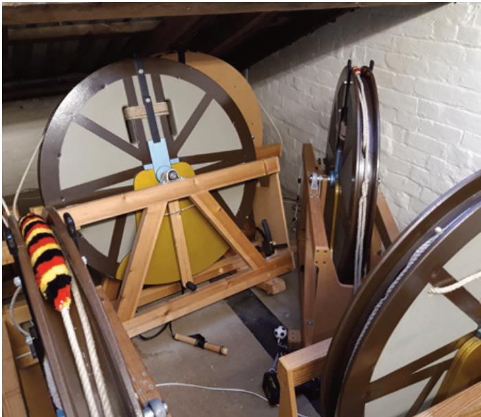
Some of the bells had to be unscrewed from the floor and tipped over to reach the screws