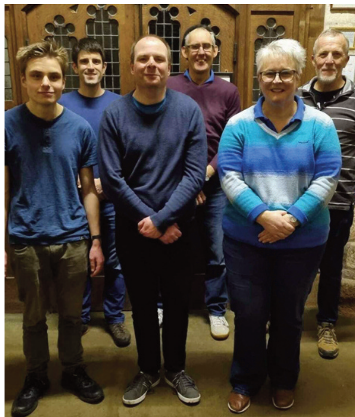
The band left to right - front row 1,2,3 back row 4,5,6

Centenary of the first peal on the bells, 24/12/1921.