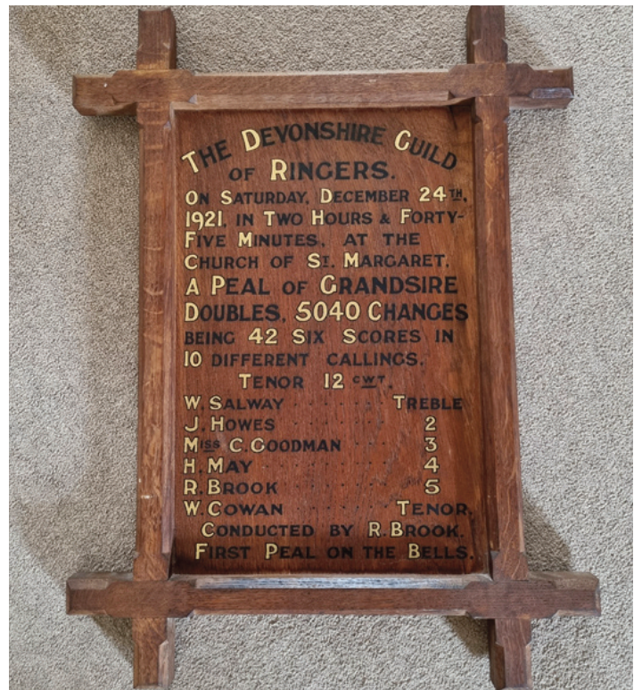
The original peal board at Topsham

On 24 December 1921, the first peal was rung on the bells at St Margaret's and this event is commemorated on a peal board in the ringing chamber.