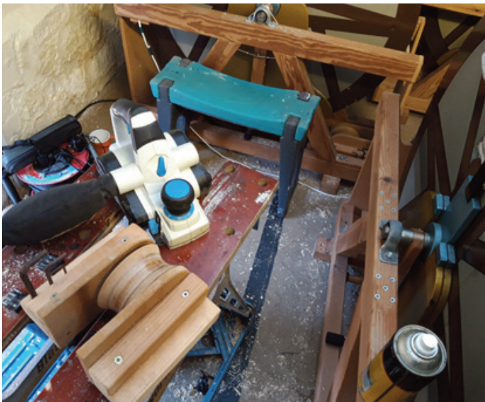
Working on one of the pulley blocks

There is a small problem with access to the school premises as the school is reluctant to divulge the access code for the door to get into the area directly from the road. I hope that this can soon be resolved, so that everything is ready for the young ringers' competition at the start of July.