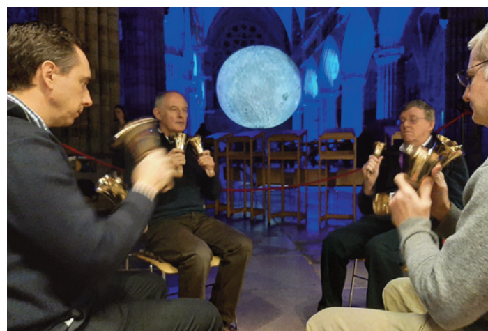
Ringling during the 'Museum of the Moon'

Rung in public in the nave of the Cathedral during the display of Luke Jerram's 'Museum of the Moon'.