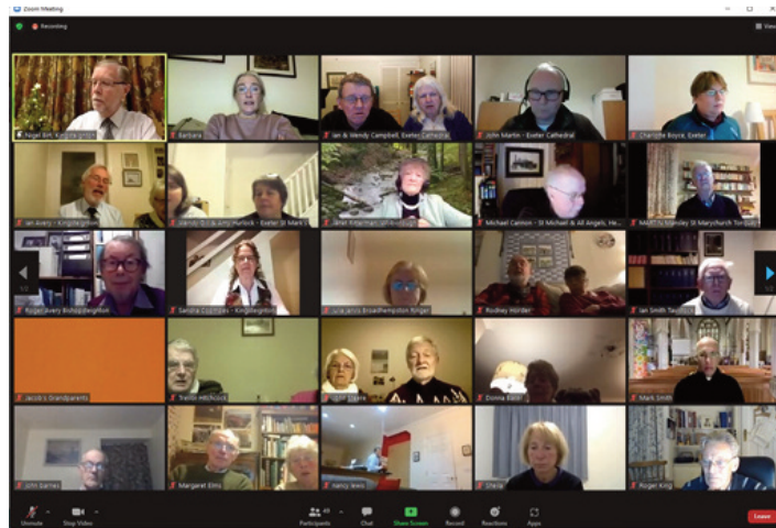
Some of those present at the virtual carol service