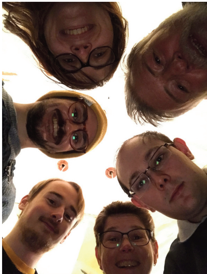
A different view of the band in ringing order

Rung for the 70th Anniversary of the accession to the throne of HM Queen Elizabeth